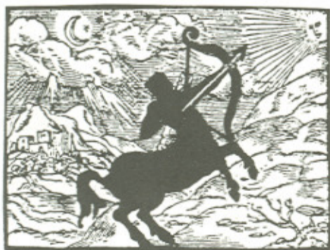
INGENIVM, ET LABOR

Carleton University Ottawa, Ontario, Canada